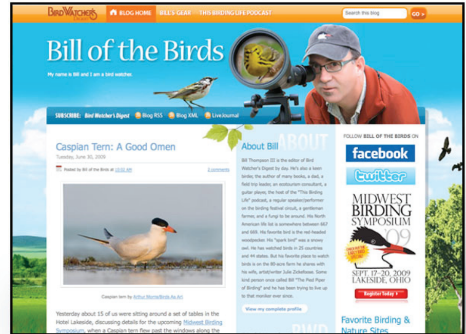
Bill of the Birds Birding Blog

The above rate includes but is not limited to a full banner homepage ad, promotion in the magazine and in BirdWire , and monthly reports generated by Google Analytics and OpenX.